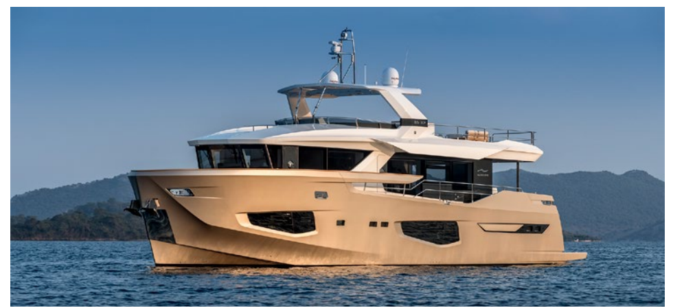
Numarine Photos - Kerem SANLIMAN