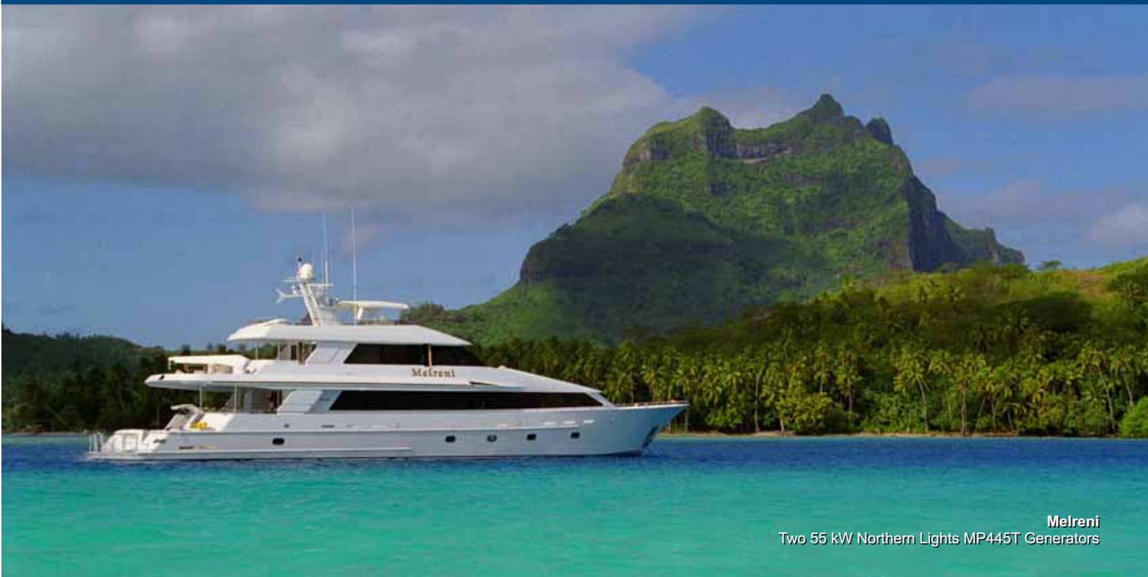
Melreni Two 55 kW Northern Lights MP445T Generators