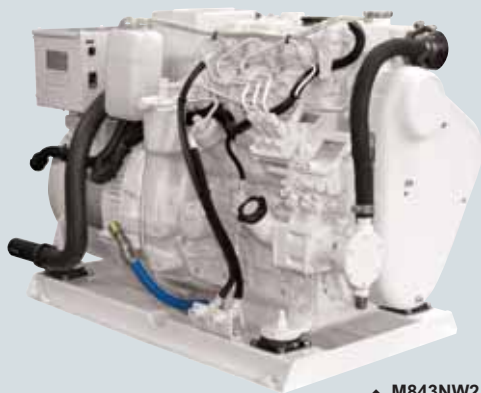
▲ M843NW2 10 - 12 kW

Two 16 kW M844K Northern Lights generators