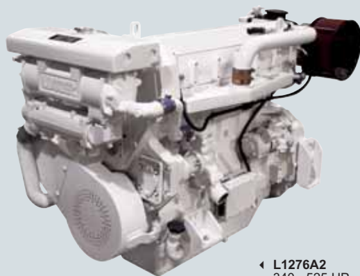
◀ L1276A2 340 - 525 HP