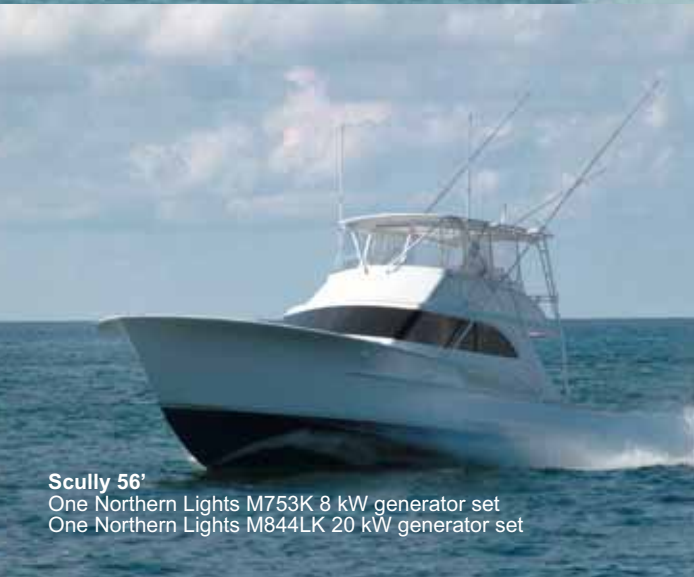
Scully 56' One Northern Lights M753K 8 kW generator set One Northern Lights M844LK 20 kW generator set