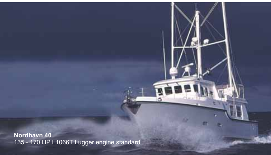
Nordhavn 40 135 - 170 HP L1066T Lugger engine standard