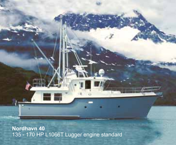
Nordhavn 40 135 - 170 HP L1066T Lugger engine standard