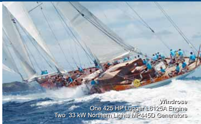
Windrose One 425 HP Lugger L6125A Engine Two 33 kW Northern Lights MP445D Generators