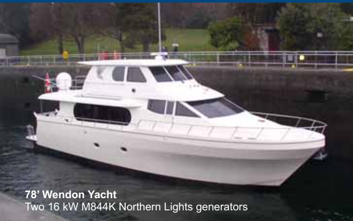
78' Wendon Yacht

Two 16 kW M844K Northern Lights generators