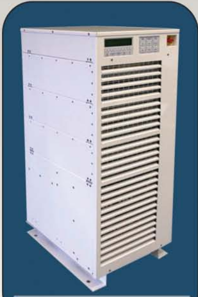
Cabinet Style "AC36Q/AC45Q"